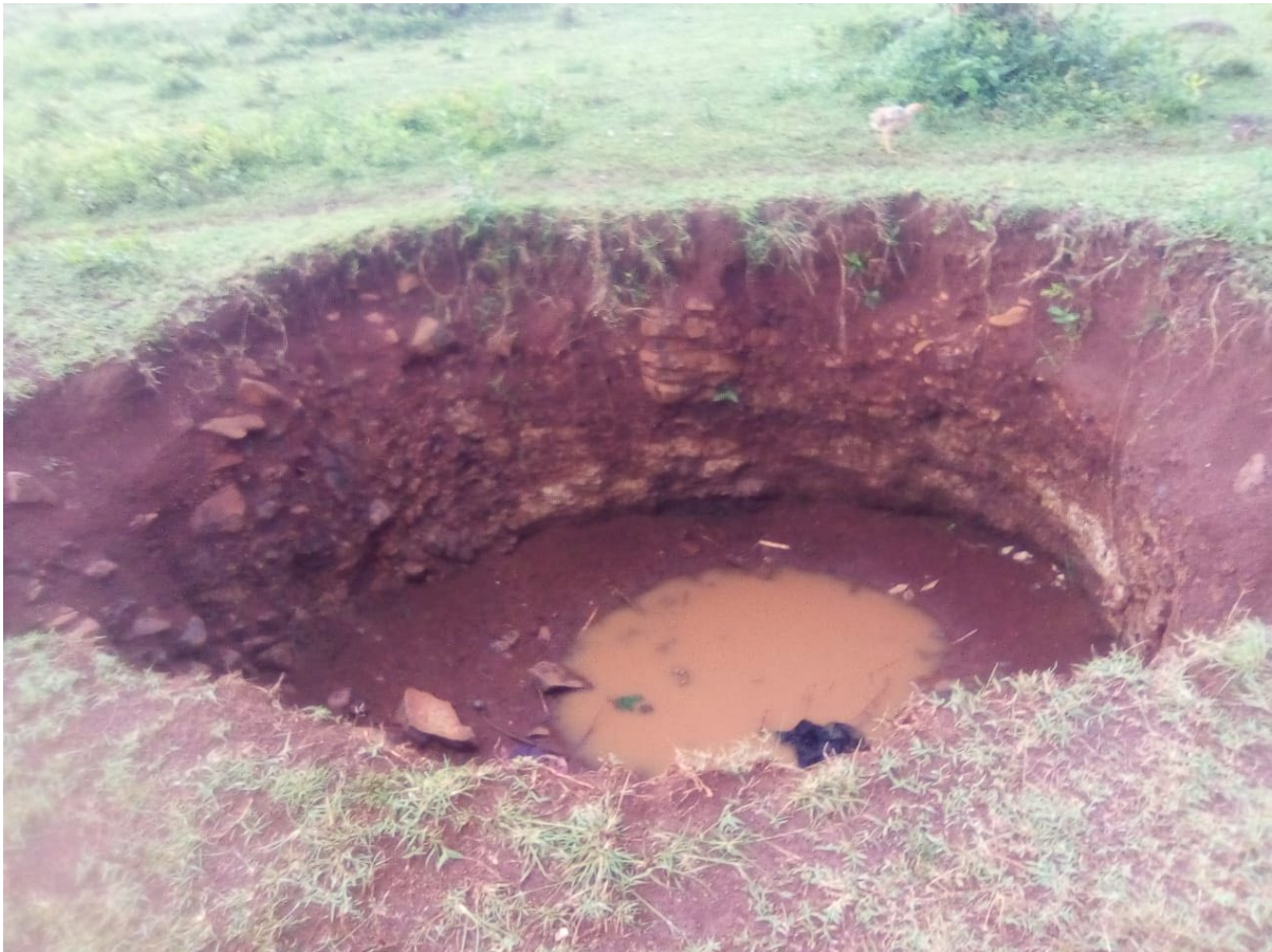
Kodida school earth pond.. the current source of water.

CURRENT WATER SITUATION – The children carry water from earth pond and seasonal river.