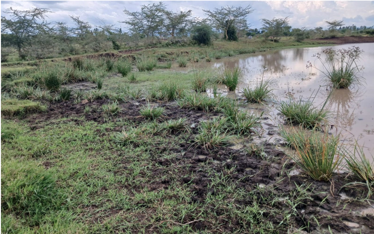
Ongang school earth pond.. the current source of water..

HOUSEHOLDS IN THE LOCAL COMMUNITY – 350 homes of 6 people on average.