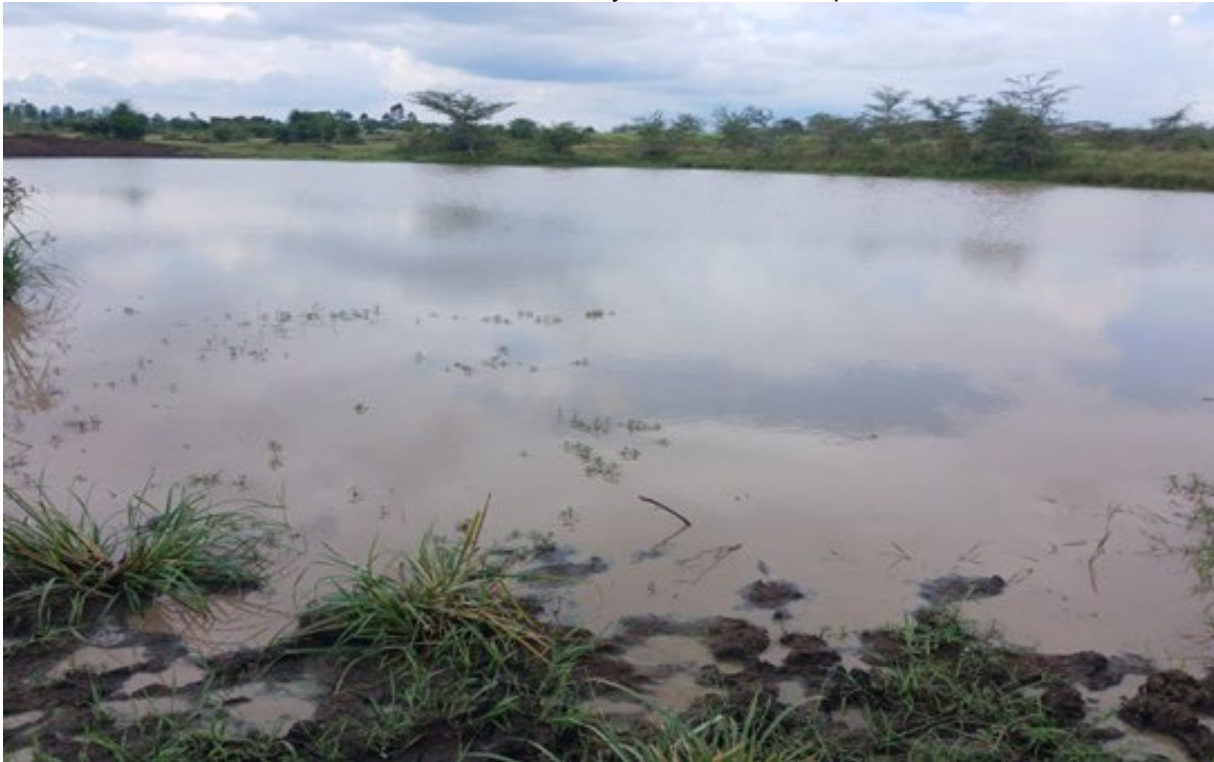
Current source of water at Oyombe Primary School

CURRENT WATER SITUATION – The children carry water from earth pond and seasonal river.